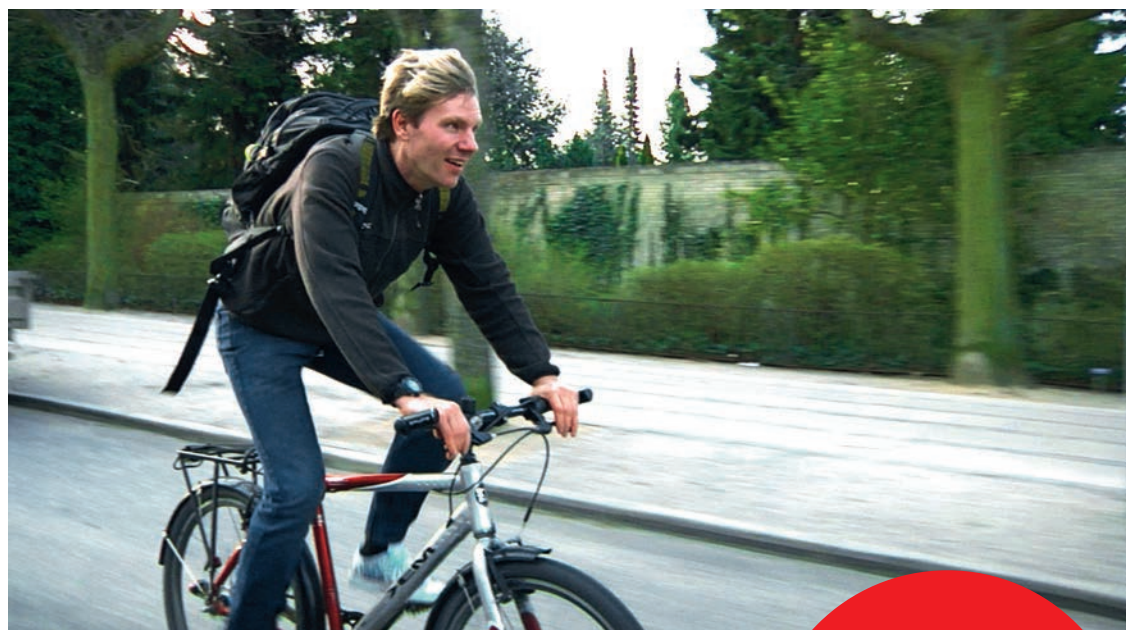
Lomborg in the film Cool It which portrayed his warm and fuzzy side.

That's also not necessarily a line of thinking that communicates well to the average person who, as science tells us, is governed much more by emotion than reason. For instance, why is it that pictures of polar bears stranded on pieces of