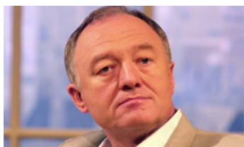
Ken Livingstone.

Ken Livingstone, 62, has dragged the capital to the top of the major world cities' environment league. He shocked the more timid Tony Blair and Gordon Brown when he set an ambitious 60% CO 2 reduction target by 2025 - and now he is championing renewables, energy from waste, heat and power systems, and ways Londoners can adapt their homes . The capital has seen a huge increase in cycling, and from this month most of the city's public buildings will be "retrofitted" to save energy. It's beginning to work, he says: four years ago, more than one in three Londoners used their cars every day; now fewer than one in five do. But he can do little about airports. Almost one-third of London emissions come from City airport and Heathrow, and there are plans for both to nearly double in size. He was nominated by Jonathan Porritt.