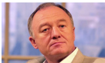
Ken Livingstone. Ken Livingstone

62, has dragged the capital to the top of the major world cities' environment league. He shocked the more timid Tony Blair and Gordon Brown when he set an ambitious 60% CO 2 reduction target by 2025 - and now he is championing renewables, energy from waste, heat and power systems, and ways Londoners can adapt their homes . The capital has seen a huge increase in cycling, and from this month most of the city's public buildings will be "retrofitted" to save energy. It's beginning to work, he says: four years ago, more than one in three Londoners used their cars every day; now fewer than one in five do. But he can do little about airports. Almost one-third of London emissions come from City airport and Heathrow, and there are plans for both to nearly double in size. He was nominated by Jonathan Porritt.